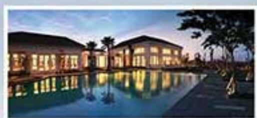
PRIVATE CLUB HOUSE Private facilities for residents only, has luxurious design, completed with pool and gym.