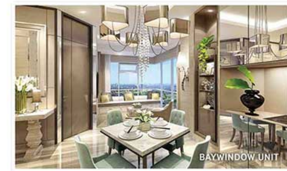
BAY WINDOW UNIT