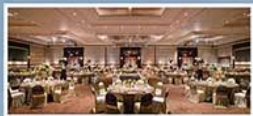
IMPERIAL BALLROOM Largest ballroom in Surabaya which can host 5,000 people in total.