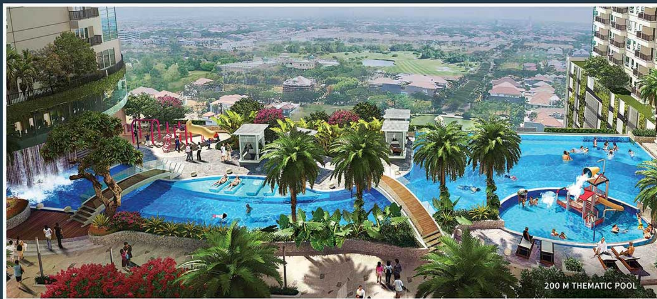
200 M THEMATIC POOL

EXPANDABLE UNITS Various types to be combined to increase the comfort of living