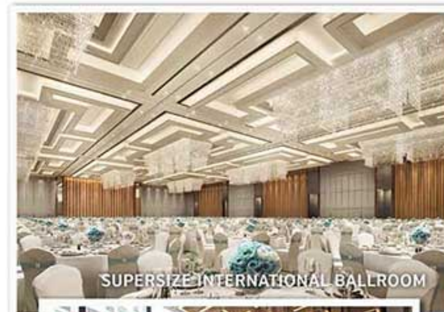
SUPERSIZE INTERNATIONAL BALLROOM