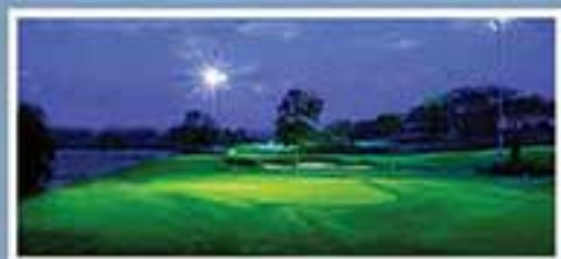
18 HOLES DAY & NIGHT GOLF COURSE Designed & constructed to meet USGA standards, will be loved by expert players and excited for beginners.

Covers 400 Ha total area and premium facilities such as 18 Hole Day & Night Golf Course, luxurious ballroom and club houses, and Pakuwon Mall as the biggest mall in Indonesia. Pakuwon Indah becomes the most prestigious township.