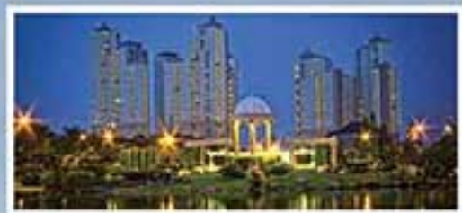
AMPHITHEATER Green facilities inside Pakuwon Indah residential that becomes its icon.