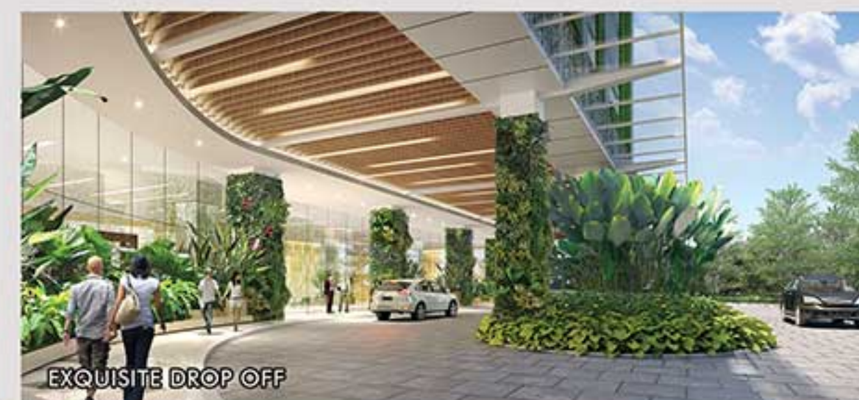
EXQUISITE DROP OFF