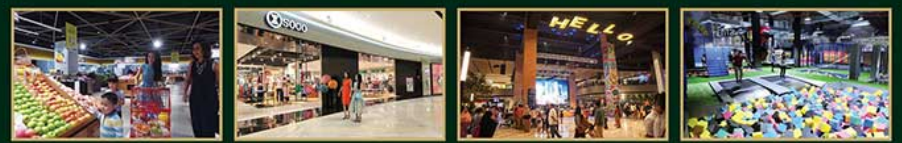
LOTTEMART SHOPPING ARCADE FOOD SOCIETY KIDS ACTIVITY