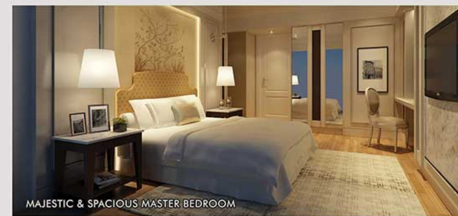
MAJESTIC & SPACIOUS MASTER BEDROOM