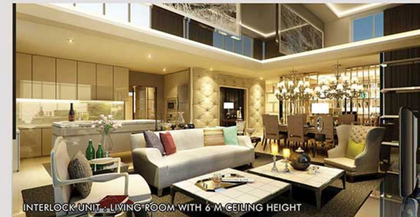
INTERLOCK UNIT - LIVING ROOM WITH 6 M CEILING HEIGHT