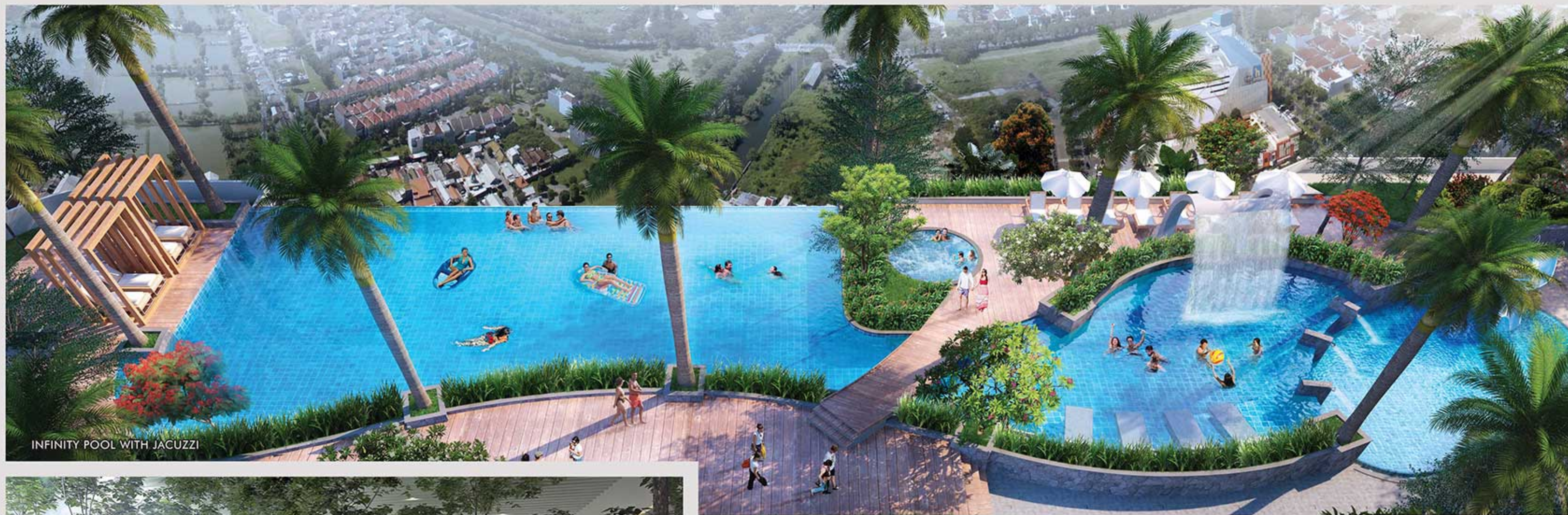
INFINITY POOL WITH JACUZZI